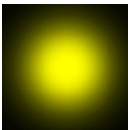
Figure 2: The “electron cloud model” for a hydrogen atom.

A better model of a hydrogen atom is the “electron cloud” model. An electron can be found, with a certain probability, anywhere inside a certain cloud. (The cloud for n=1 is shown in Figure 2.) The shape, size, and configuration of this cloud depends on the energy of the electron. Though this model is more accurate, our simple minds prefer simple models based on things we already understand. Thus, we'll often appeal to the Bohr model as we think about energy states of a hydrogen atom.